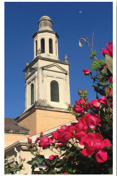
CALVARY BAPTIST CHURCH, WACO, TEXAS 2018 Baptist Women in Ministry Church of Excellence

Baptist Women in Ministry celebrates Calvary's commitment to the work of the gospel, its generous and faithful support of our organization, and its affirmation of women ministers, and today with much excitement we recognize Calvary Baptist Church, Waco, Texas , as the 2018 Church of Excellence!